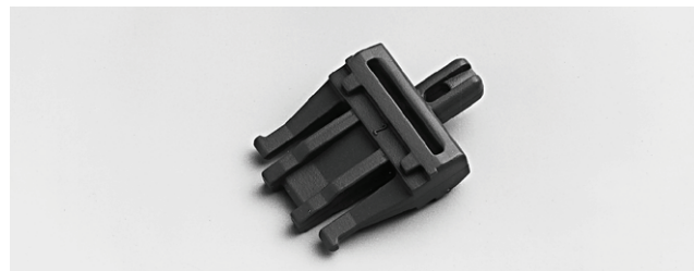
Dummy plug, 3-pole