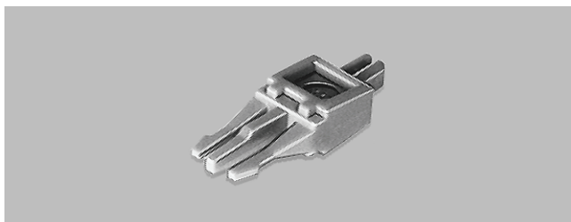
Disconnection plug, 1 pair

Universal plug accessories for the LSA-PLUS and LSA PROFIL modules, series 2.